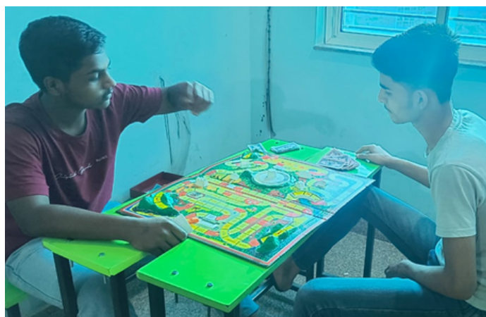
Learning Business through play at Kanhai

And as we enter the next academic year, we are hopeful of a stronger and deeper collaboration with our generous donors at multiple levels.